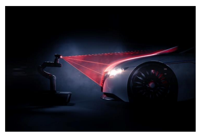
The MAHA Autonomous Inspection Assistant (MAIA) carries out checks on a car

Click on the following link to read the latest news about MAHA's trade fair highlights: MAHA | Automechanika 2024 trade fair highlights