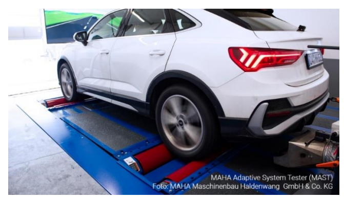
MAHA Adaptive System Tester (MAST)